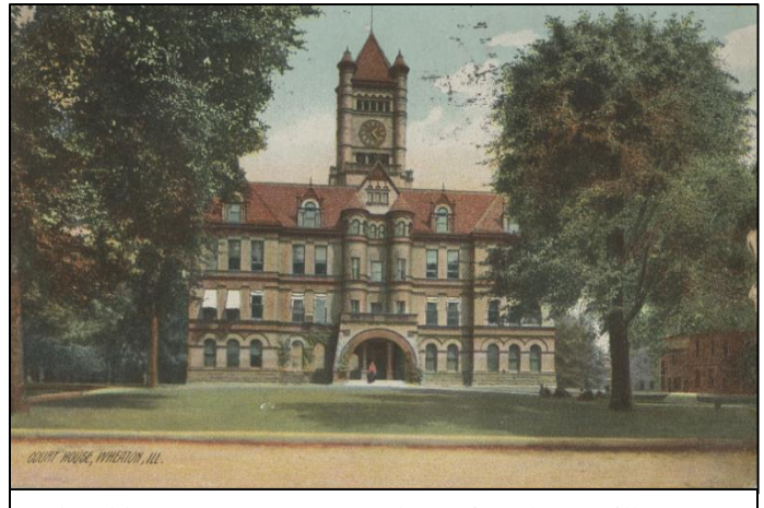
The old DuPage County Courthouse in Wheaton illustrates the Richardsonian Romanesque architectural style

The Supreme Court Library notified the Commission that it possessed a number of old law books and statute books that had some damage. The Commission's collection manager inspected the books and began a treatment program to mitigate the damage to preserve the books for many years.