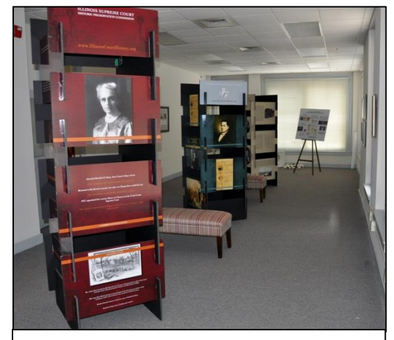
Exhibit space at Commission offices

In 2014, the Commission moved to new and less expensive office space in Springfield. The staff occupies the second and third floors of the Booth-McCosker Building at Sixth and Monroe Streets. Utilization of the space includes a full library, a collections room, a conservation/preservation room, and space to exhibit artifacts.