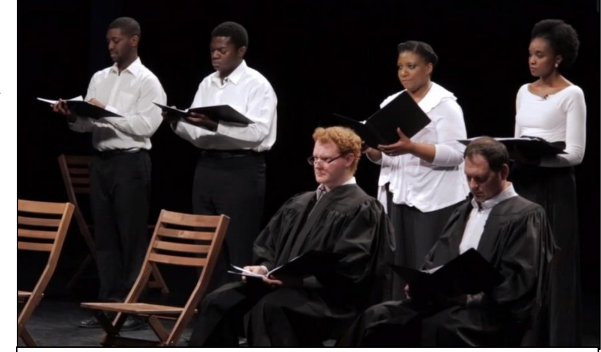
History on Trial: Alton School Cases performance at Lewis and Clark Community College in Alton, Illinois on April 20, 2015